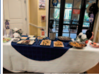
Our Christmas Party