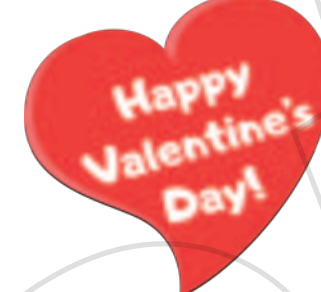
Happy Valentine's Day

9:00 LR Wheel of Fortune 10:00 LR Sweating to the Oldies 10:30 LR What Did it Cost 1:15 PG Putting Green 2:15 LR Unscramble the Word 3:30 AR Pokeno 6:15 LR Movie-Erin Brockovich