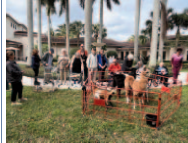
Cock A Doodle Doo