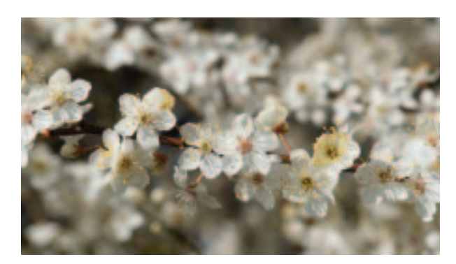
IT'S MARCH-HAPPY NEW YEAR, AN-CIENT ROMANS!

Welcome to the third month of the year-or if you were born before 150 BC., the first! According to the oldest Roman calendars, one year was ten months long, beginning in March and ending in December. It may sound crazy, but you can still see traces of this old month naming system in our modern calendar. Because December was the tenth month, it was named