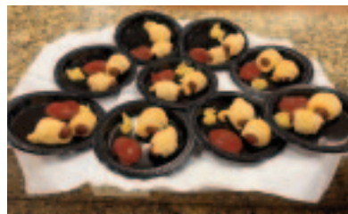
Good snacks always