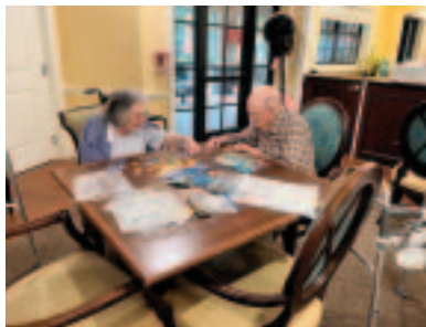
Fun with Puzzles